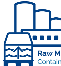
Raw Material Supplier Container Fill Site