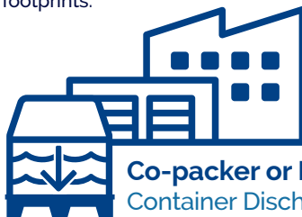
Co-packer or End User Container Discharge Site